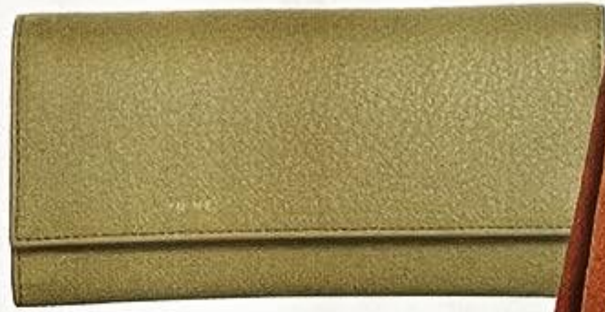
Yu Mei 'Sebastian' wallet, $465