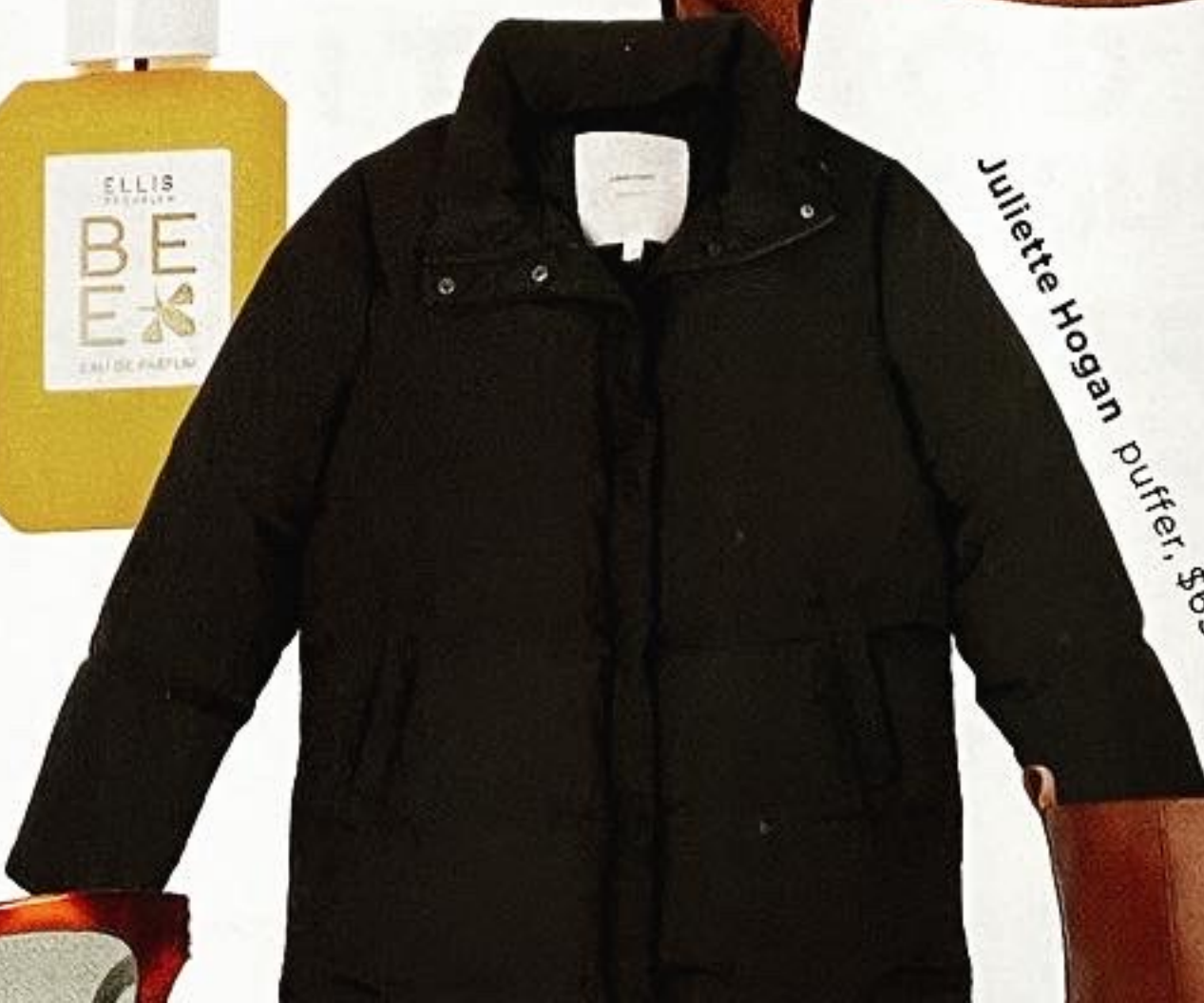
Juliette Hogan puffer, $659