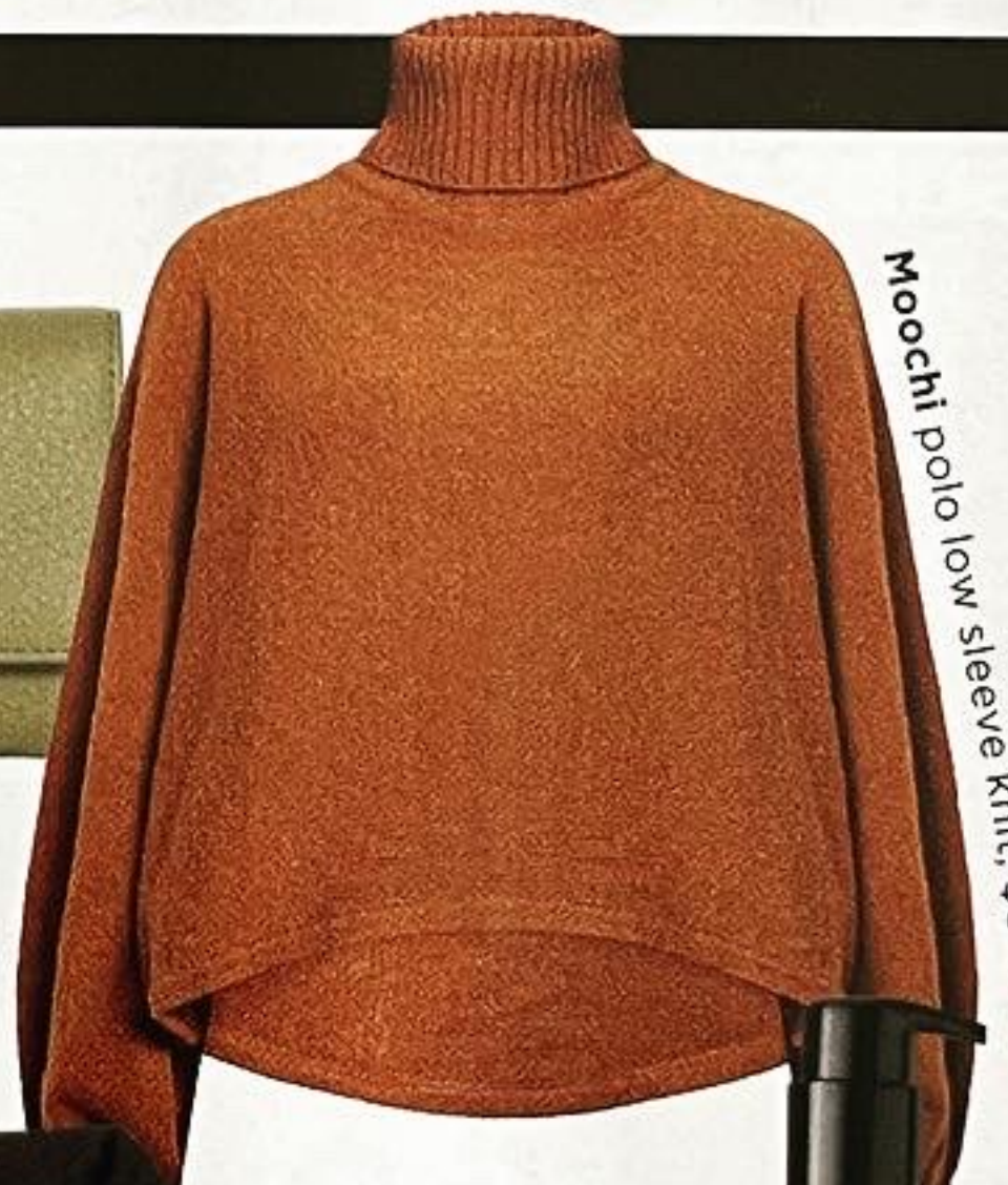
Moochi polo low sleeve knit, $340