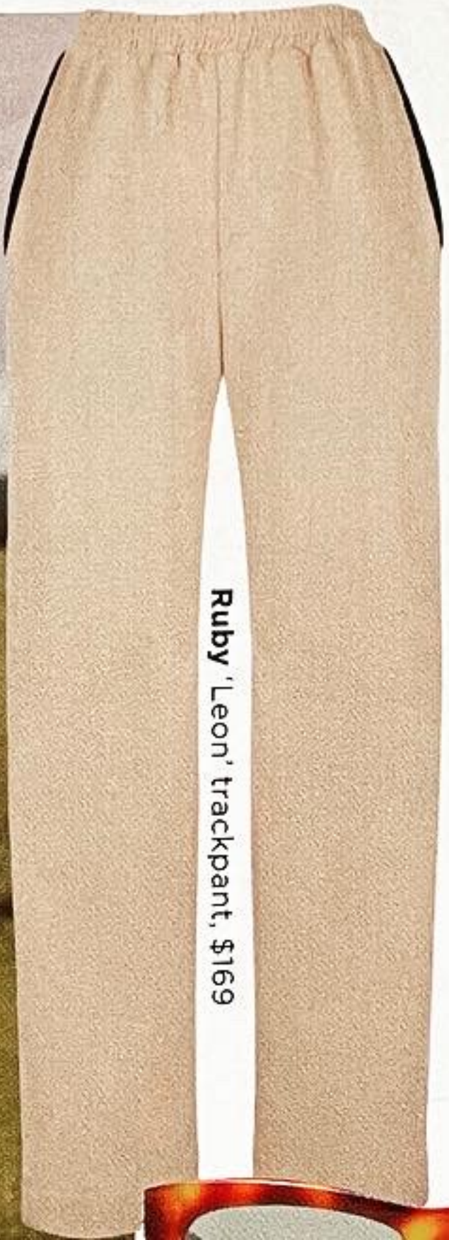
Ruby 'Leon' trackpant, $169