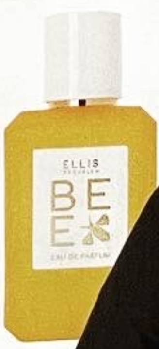
Ellis Brooklyn Bee 50ml EDP, $178 from Mecca