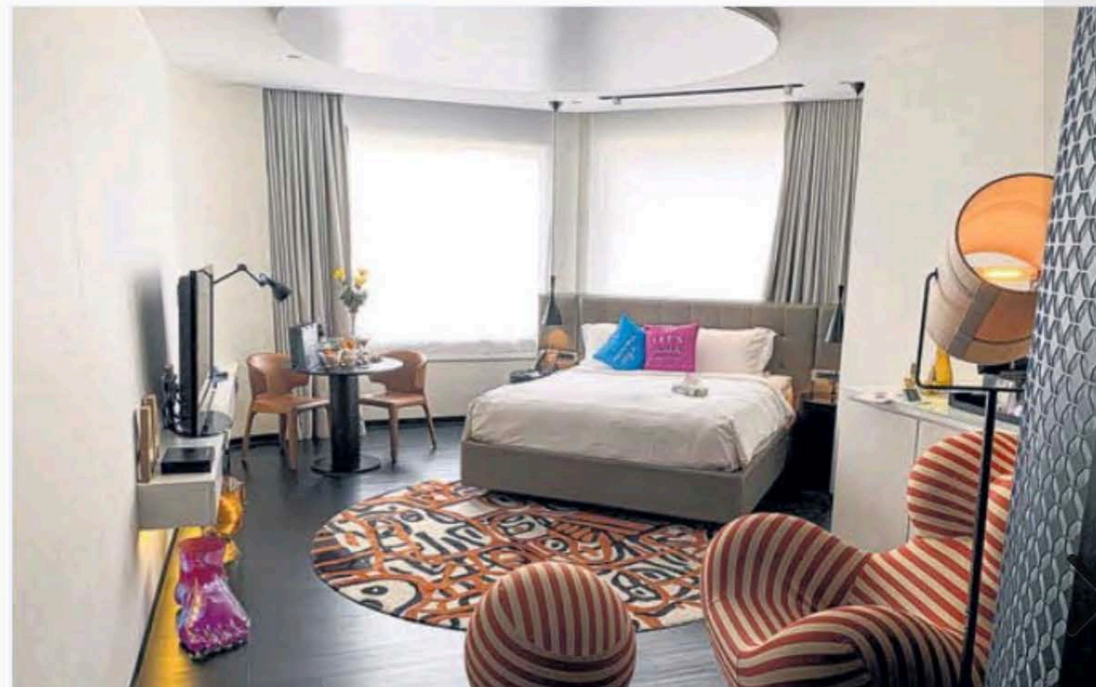
(Above) Playful decor brightens up the Eden & Nirwana room.

Other high points: the proactive hotel staff as well as the plush bed