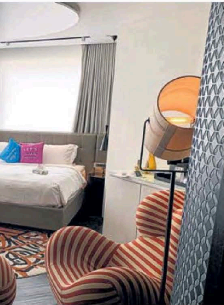
to the Eden & Nirwana room.