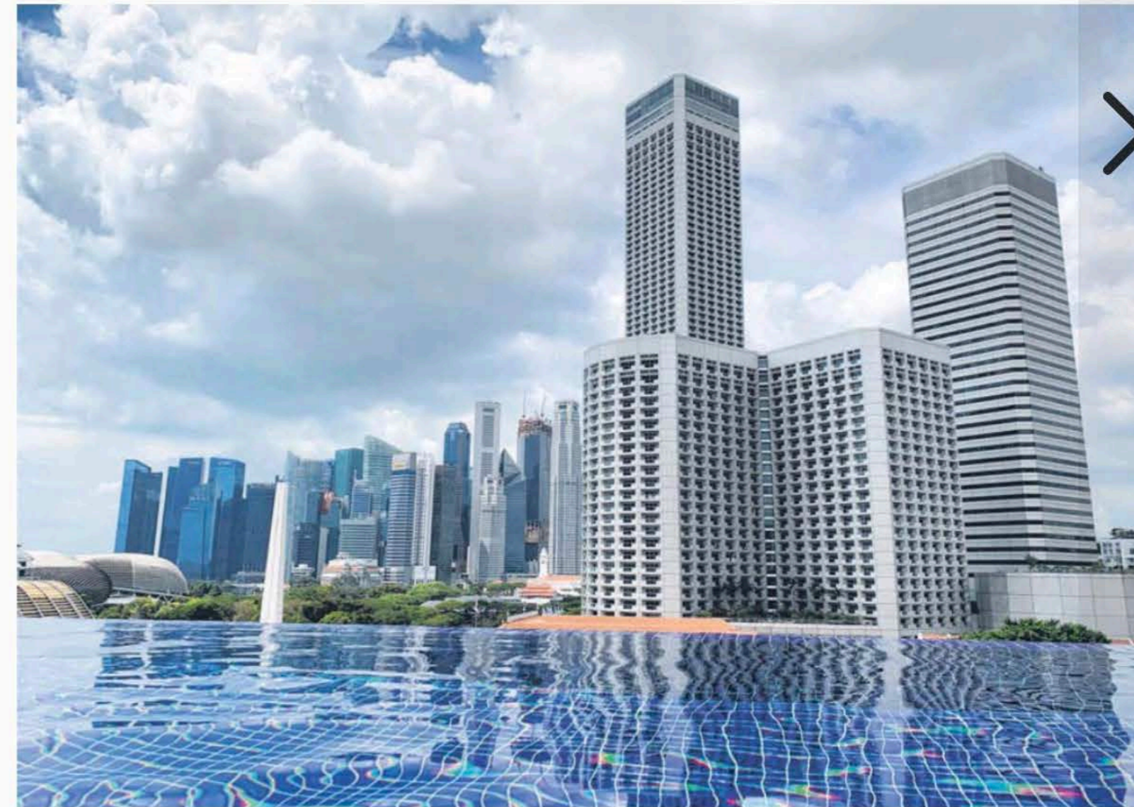
Naumi's 10th-storey rooftop pool offers views of Bugis and the Central Business District.

the warm water infused with bath salts that the hotel provides. It almost feels as though my room has a