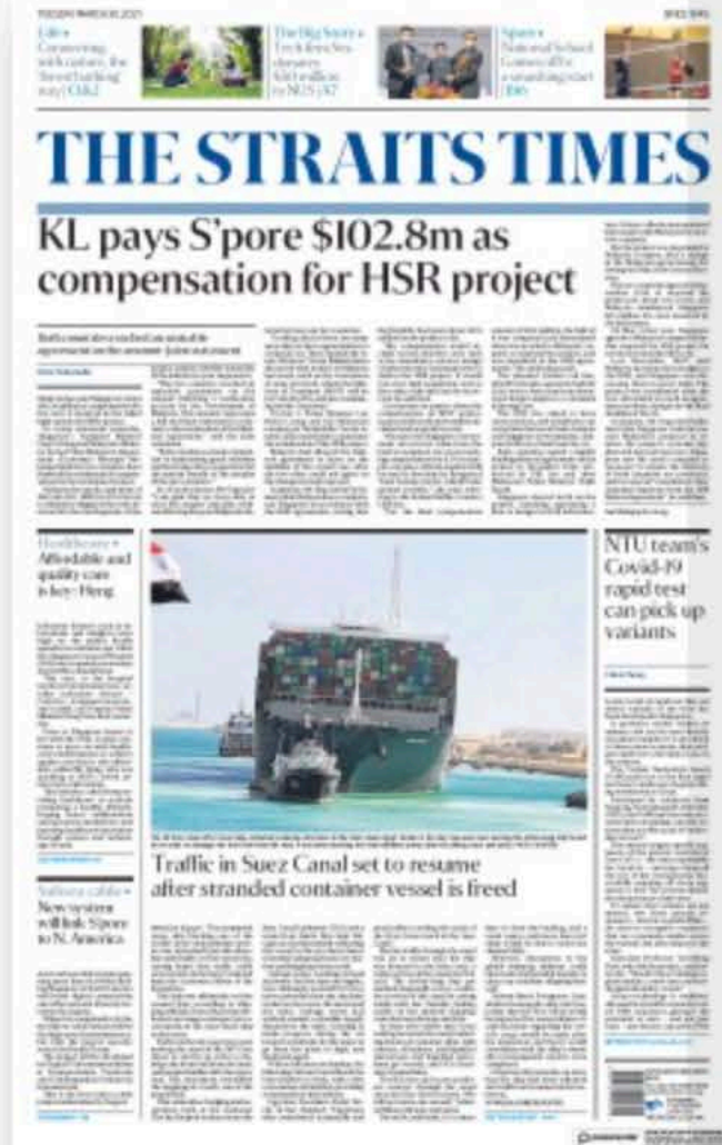
The Straits Times 30 Mar 2021 (C5)

To escape the queues at popular eateries in the area, get takeaway and pop up to the rooftop for dinner with a view by the pool. Just remember to book a time slot.