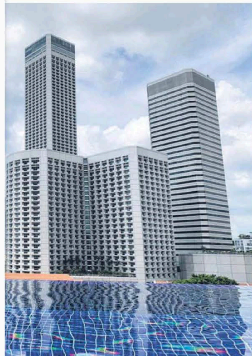
views of Bugis and the Central Business District.