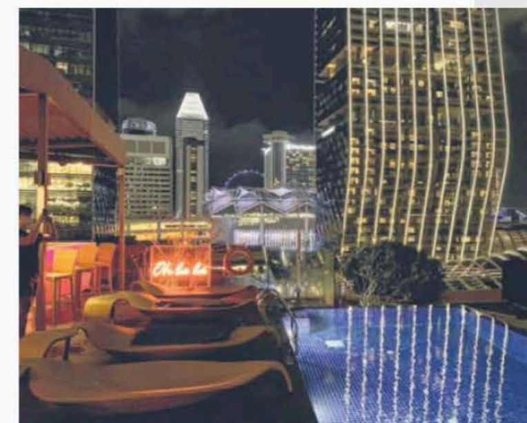
(Left) Escape the crowds at Bugis’ many popular eateries by getting takeaway for dinner with a romantic view by the pool.

A downside is that the in-house restaurant is currently closed, so